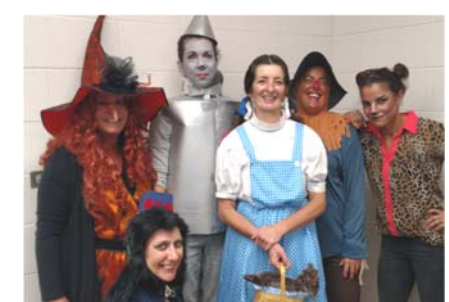
HOLIDAY FUN FROM THE KITCHEN STAFF