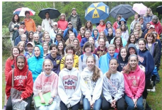
7th GRADE ANNUAL MACKINAW TRIP