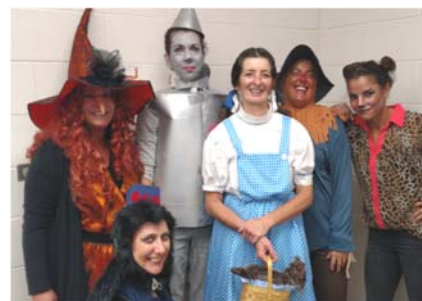
HOLIDAY FUN FROM THE KITCHEN STAFF

In our quest to continue to be a "green" school, Hanover-Horton Middle School is now recycling all textiles. This means clothing, shoes, linens, towels, stuffed animals, belts, purses, accessories, etc., even if they are worn, torn, or damaged, we can recycle them! Donations can be placed in the bin located behind the middle school. At the end of the year, all the pounds collected will be totaled up, and there will be monetary prize for all the recyclables collected from our school. You can help our school raise some funds while helping the environment at the same time.